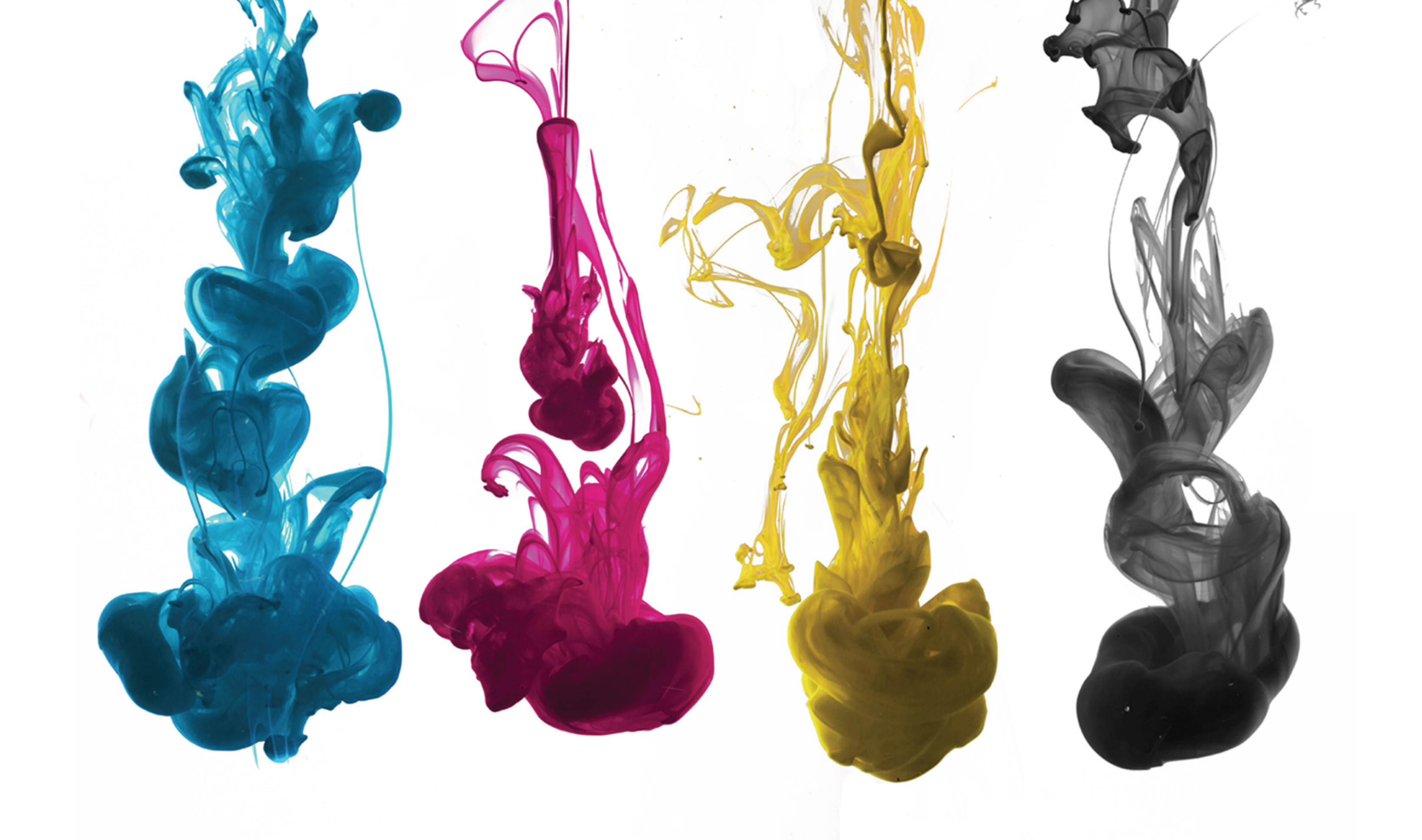
INK: Apart from pencil, pen and ink drawings are arguably the most convenient, portable, and low-cost form of art designing. With just a piece of paper and pen, you are set to start designing. Ink is one of the most common mediums in contemporary arts, for almost everyone has tried creating art using pen. The different types of pens available for drawing include fountain, reed, drafting, graphic, and ball point pens.