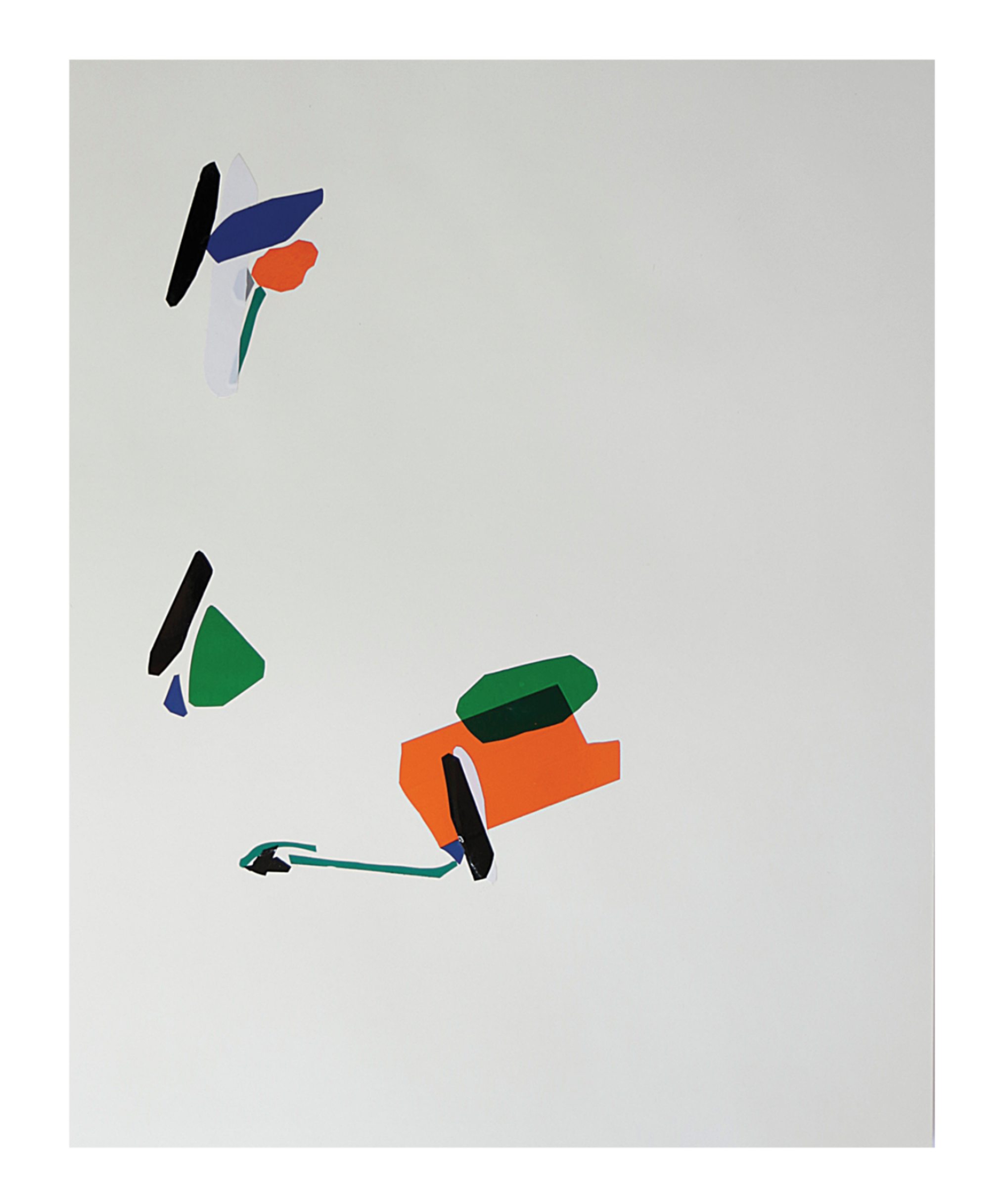
Rhythm number 24. Tape on paper. 47 x 35 cm. 2018